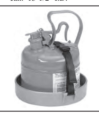
Model QM-RGC-9: Round safety can mount was designed for 1 or 2-gallon can. 9-3/4" I.D. x 2-1/8" deep.