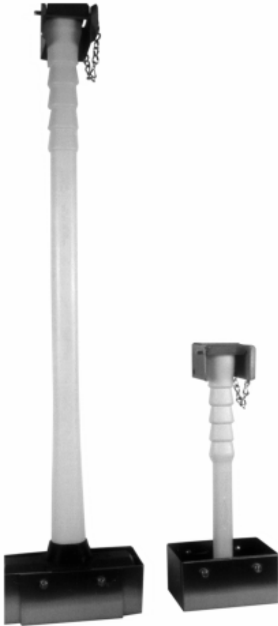
Brackets shown with 12 and 3 pound sledges

Sledge Hammer Bracket mounts vertically or horizontally.