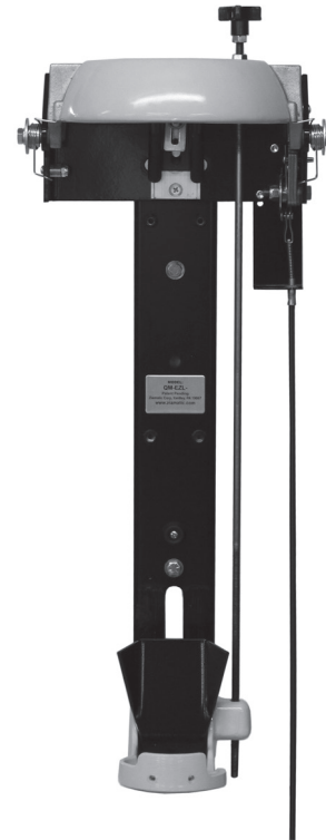
QM-EZL-F shown with adjustable footplate